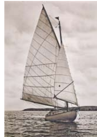
The "Tioga" under sail